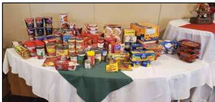
Non-perishable food items donated to Ruth's Place.