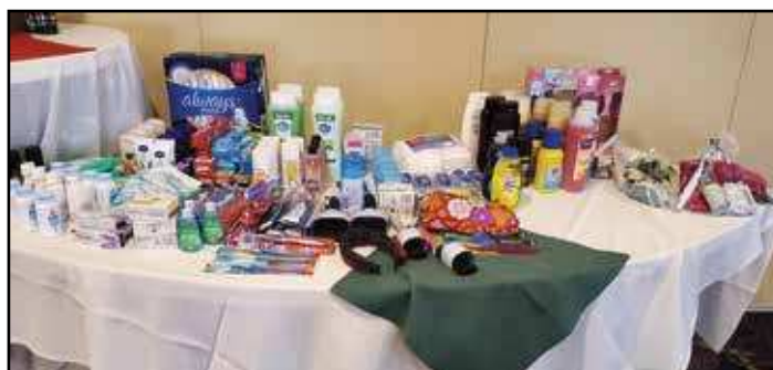
Toiletries donated to Ruth's Place.

Remember to notify the Home Office if your address changes!