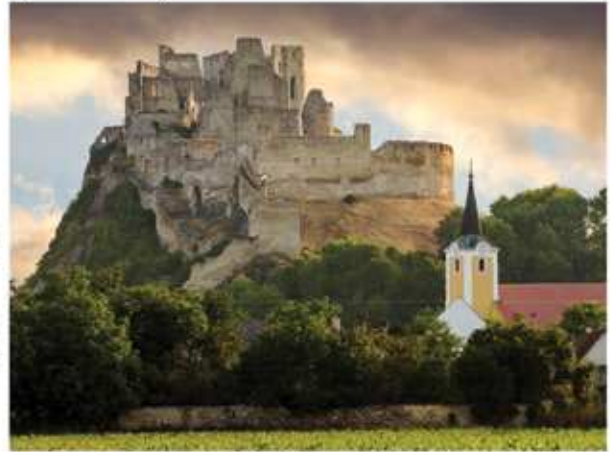
Beckov Castle is located above the former town of Beckov in Nové Mesto nad Váhom District, in the Trenčín Region of Western Slovakia.

All the servants were involved in building the castle for Becko. Two years later, there was a beautiful castle towering on the rock. Stibor did not really want to leave the castle to Becko, but he did not want to break his promise. Therefore, he offered Becko the chance to buy the castle from him. Becko agreed upon the condition of getting as much gold for the castle as he could take on his back and that the castle would bear his name—Becko Castle. And so it was.