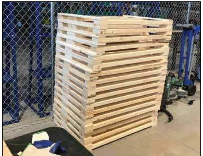
A stack of freshly assembled headboards.