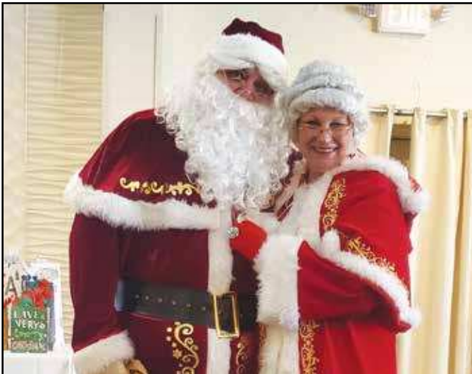
Santa and Mrs. Claus made an appearance too!