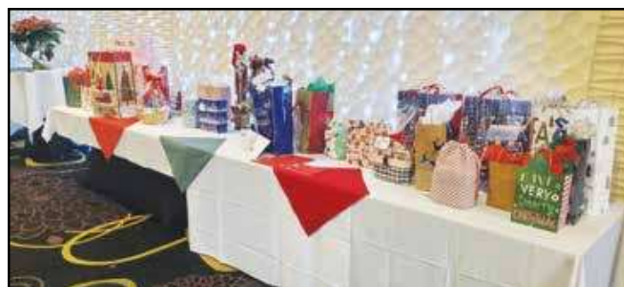
Raffle prizes waiting to be won.

Party attendees heard first-hand how much of an impact their donations make to the women who seek help from Ruth's Place. Everyone was very moved by the heartfelt thanks offered by Ruth's Place representatives in attendance.