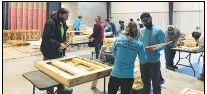
Some of the workstations for bed assembly.