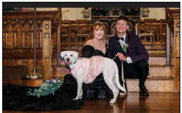
The newlyweds with their dog, Duckie, who served as their ring bearer.