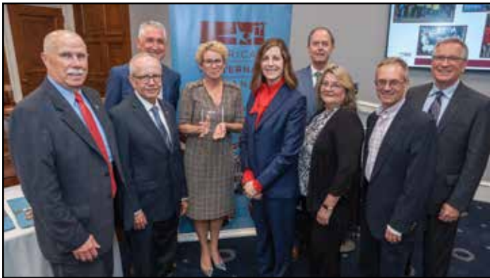
Meeting with Pennsylvania Representative Chrissy Houlahan.