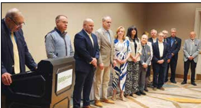
NJNYFA officers and board members are pictured during their installation.