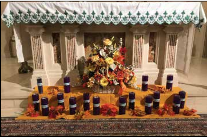
View of remembrance candles placed at the altar.