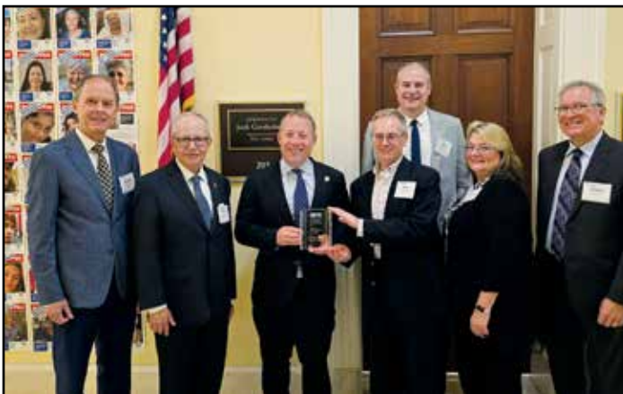
Meeting with Representative Josh Gottheimer of New Jersey.