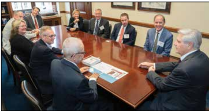
Meeting with Senator John Hoeven of North Dakota.