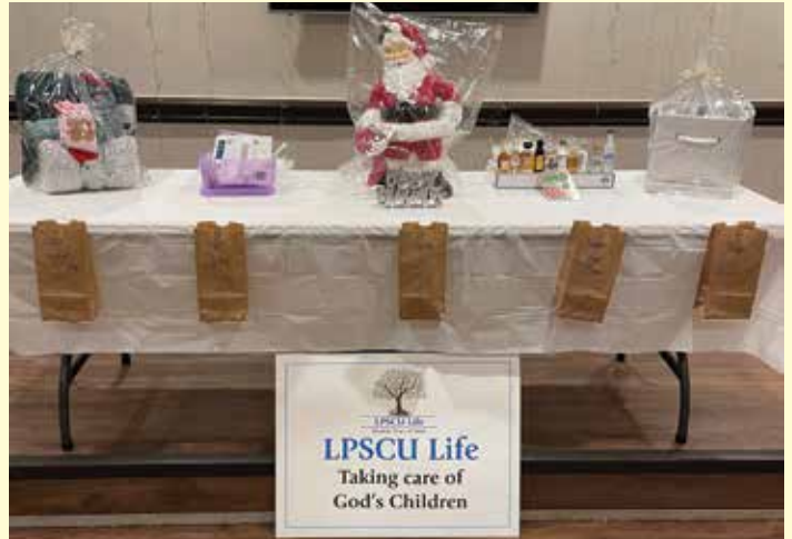
Beautiful prizes wait to be won.