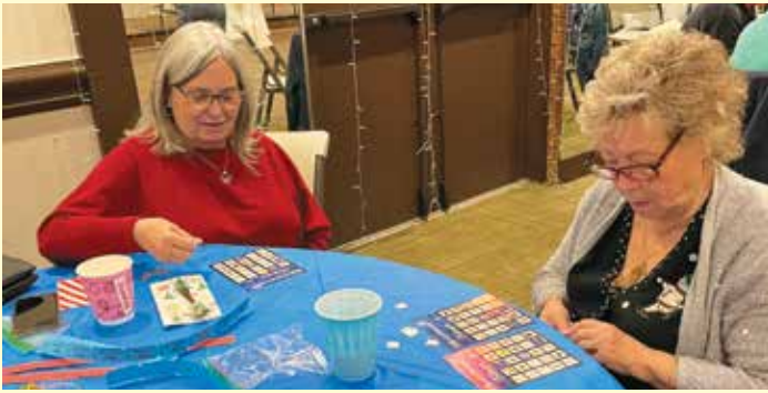
Attendees intently watch their bingo cards.