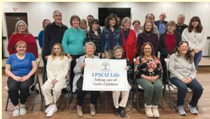
Branch 52 members and guests.