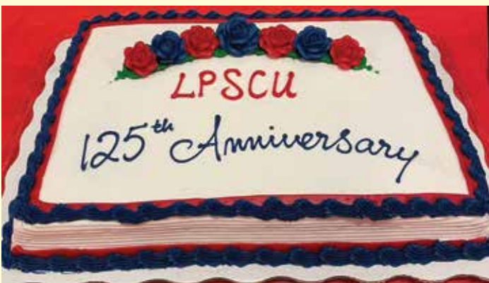
A special cake celebrates the LPSCU's 125th Anniversary.