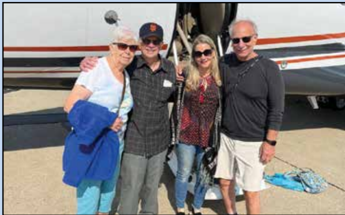
Getting ready to board a private jet for the flight to California.