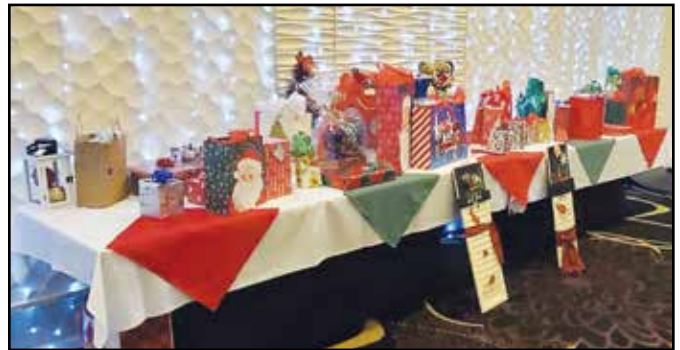
Raffle prizes waiting to be won.