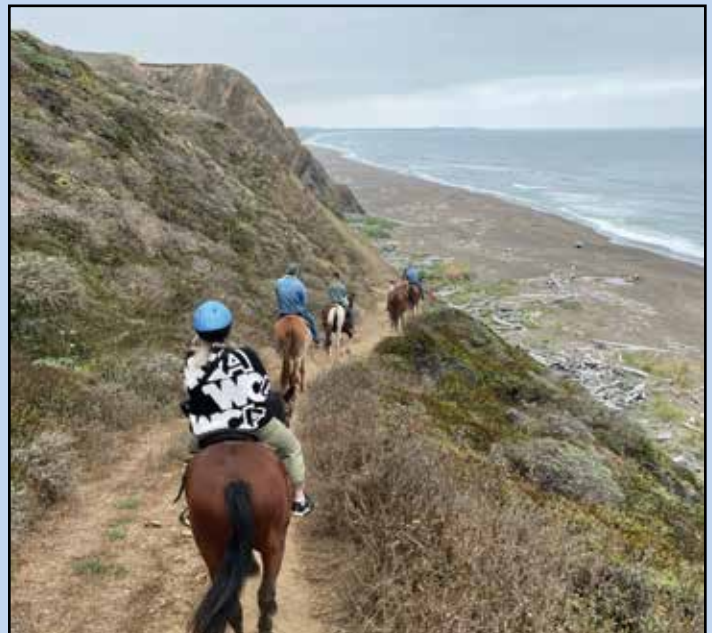
Horseback riding on a beach in Mendicino County, California.