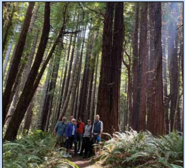
The group hiked among the redwood trees in Sea Ranch.