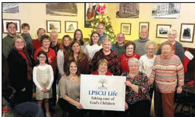
Members and guests who attended the Msgr. Beeda District's Christmas party.