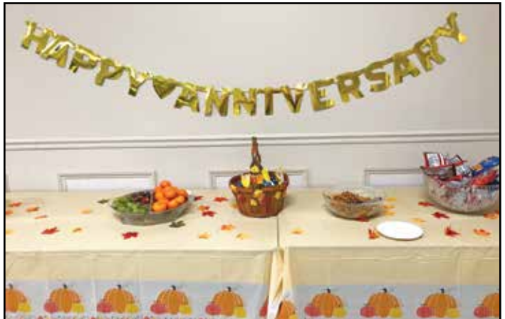
Some of the tasty treats available.