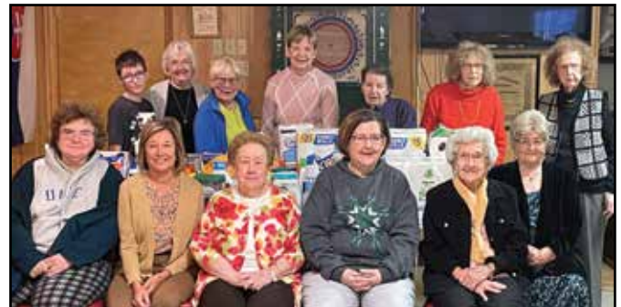
Rev. Dianiska District members attend their Fall 2023 meeting and celebrate "Make a Difference Day."

Officers for the 2024-26 term were elected and will be installed at the 2023 Christmas Party. Meeting dates for 2024 will be determined and announced at a later time.