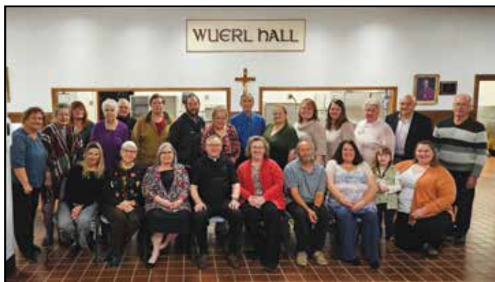
Members of the Pittsburgh District who gathered to celebrate the LPSCU's 125th Anniversary.

The gathering concluded with a delicious cake to celebrate the occasion.