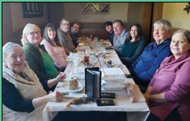
Members from the northeast Illinois area celebrate the LPSCU's 125th Anniversary.

LPSCU members from the northeast Illinois area enjoyed their opportunity for fellowship as they celebrated the 125th Anniversary of the Ladies Pennsylvania Slovak Catholic Union. The event was held at Sorrento's Steak House, located in Maple Park, Illinois, on Sunday, October 15, 2023. The group enjoyed having the opportunity to gather and recognize this major milestone in the history of the LPSCU.