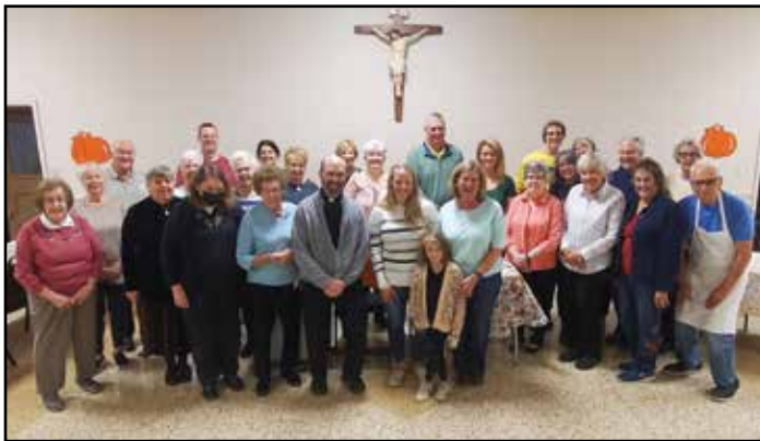
Attendees at Branch 83/130's "Turn Back the Clock" Bingo.