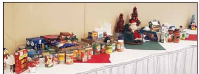
Nonperishable food items collected for Holy Family Food Pantry.

It was a wonderful way to begin the holiday season, and everyone left with a smile on their face.