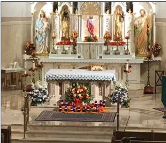
View of remembrance candles at altar.