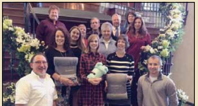
District members display the blankets they collected for Divine Providence Homeless Shelter as their "Make a Difference Day" project.