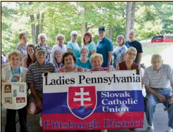
Members and guests of the Pittsburgh District at their summer picnic.