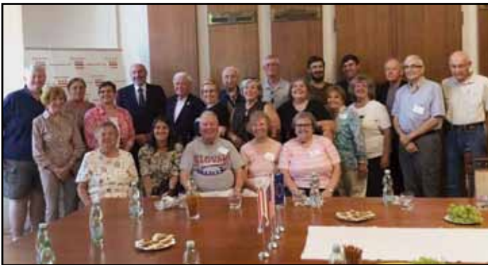
Pittsburgh's sister city, Presov, held a special reception for the group at the mayor's office.