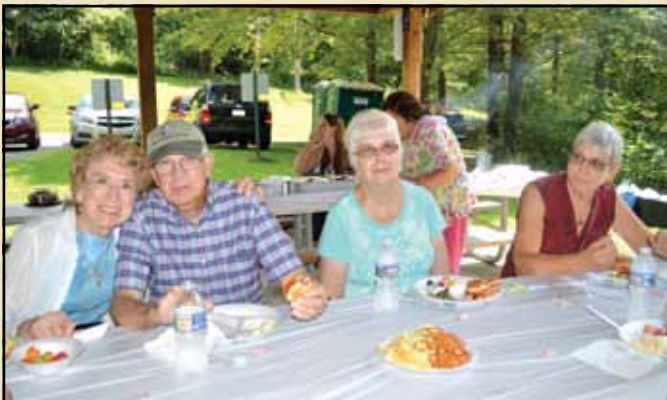
Pittsburgh District members enjoy delicious picnic fare.