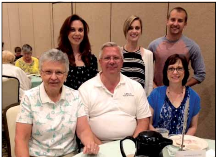
LPSCU members from other branches who attended Branch 60's breakfast.