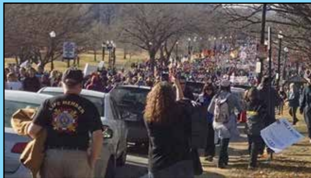
Participants await the start of the March on Constitution Avenue.