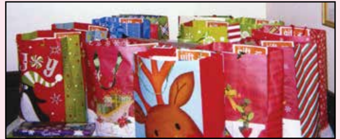
Colorful bags hold Christmas gifts for Branch members.