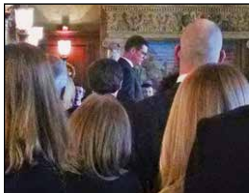
Slovak Ambassador to the United States Peter Kmec addresses the attendees.