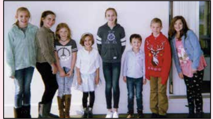
Young members of Branch 52 who attended the Christmas party.

Everyone enjoyed a memorable time and Branch members are looking forward with anticipation to another great LPSCU year.