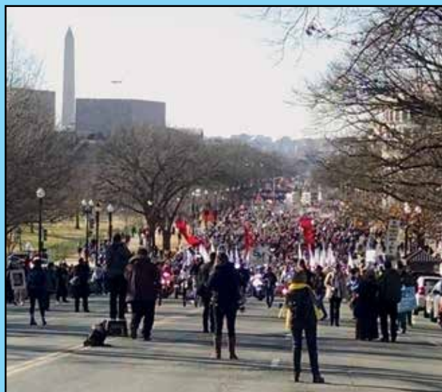
Thousands of March participants walk along Constitution Avenue, heading towards the Supreme Court.