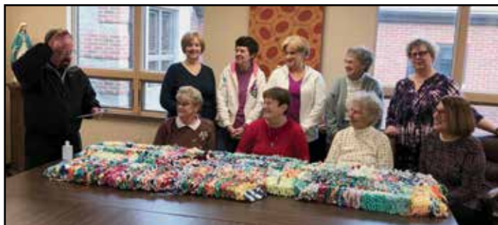
Members of the Prayer Shawl Ministry at Most Holy Rosary Parish display the water filter socks they crocheted for the Water With Blessings program.

The group also collected for the purchase of four of the water filter units. Thus, the work done by these volunteers at Queen of the Most Holy Rosary Parish will help provide clean water to at least 3,200 families, protecting them from dysentery, intestinal parasites, and other water-borne illnesses.