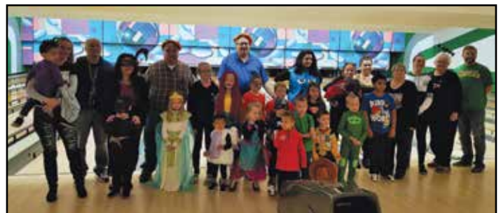
Pictured are the participants at United Slovak Societies' Halloween bowling party.

On Sunday, October 29, 2017, the United Slovak Societies sponsored a children's Halloween bowling party for the local lodges at the American Slovak Club in Lorain, Ohio. The children bowled a few games then received treat bags, pumpkins, pizza, and cupcakes. A terrific time was had by all. LPSCU Branch 77 in Lorain is a member of the United Slovak Societies.