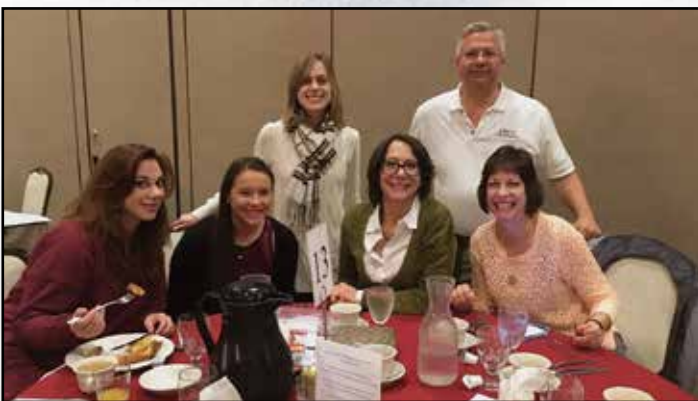
Pictured above are the members of Branch 39 and their guests enjoying breakfast.