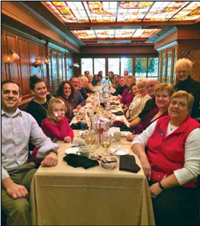
Members of the Msgr. Beeda District enjoying their Christmas party.

The Msgr. Beeda District would like to wish everyone a very Happy and Healthy New Year!