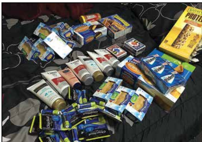
Some of the items sent to U.S. service members at Tokota Airbase in Japan.