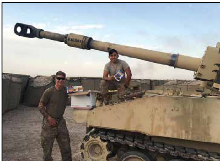
Members of the “Steel Dragons” stationed in Iraq, 2-82 Field Artillery Division based out of Fort Hood, Texas, were recipients of the team’s care packages.