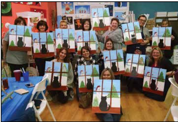
The artists proudly display their work.

Participants got together for an evening of painting and fun and raised a total of $300, which includes a Matching Fund donation of $100 from the Ladies Pennsylvania Slovak Catholic Union Home Office.