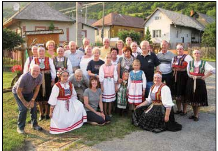
Participants with some of the locals on one of our past tours.