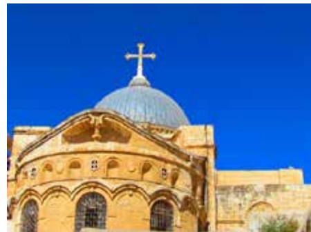
Church of the Holy Sepulchre