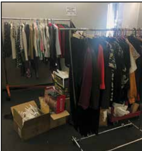
Some of the items collected at the Pittsburgh District's recent clothing drive.

Dress for Success Pittsburgh promotes the economic independence of women by providing professional attire, a network of support, and the career development tools to help women thrive in work and in life. The items were distributed at mobile events Dress for Success held over the rest of the summer. Dress for Success Pittsburgh and the women who received the items really appreciated the support.