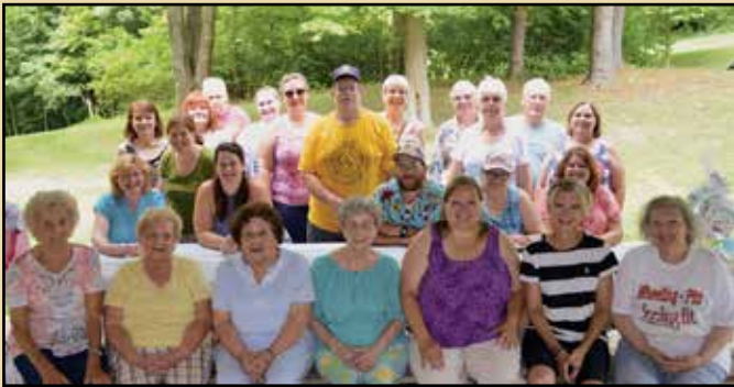
Members and guests who attended the Pittsburgh District’s summer picnic.