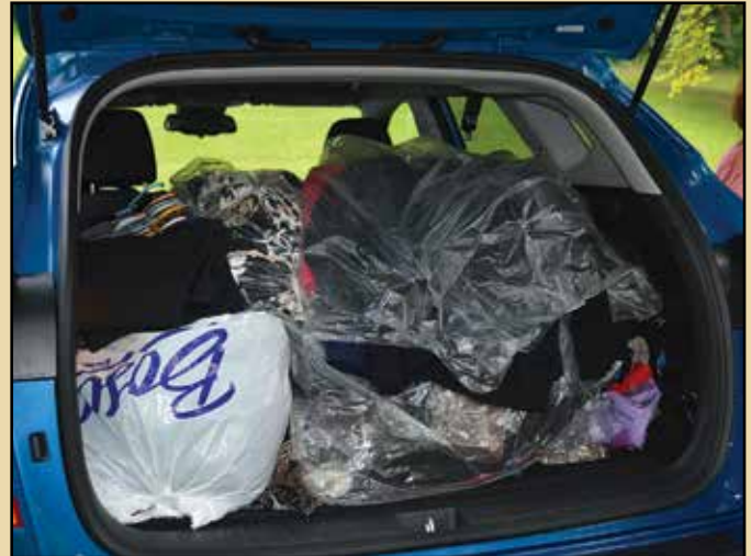
Members generously donated clothing and accessories in support of the District’s “Dress for Success” project.