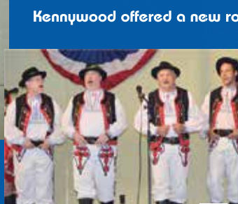
Kennwood offered a new ro