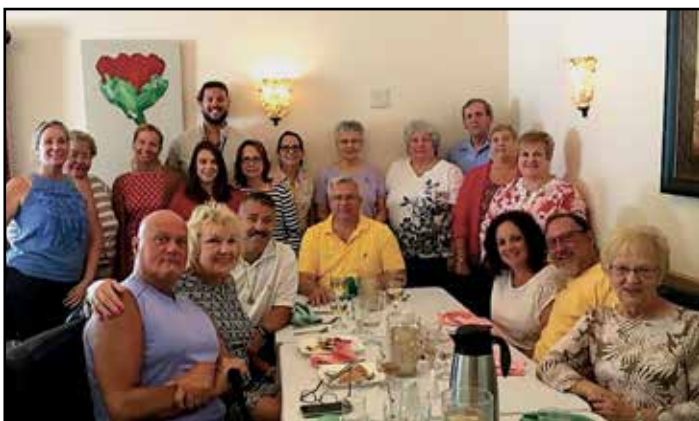
LPSCU Branch 60 members and guests at the breakfast at Four Blooms Restaurant.