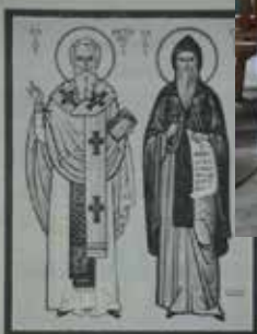
SLOVAK DAY Kennwood Park Mass in Honor of Sts. Cyril and Methodius