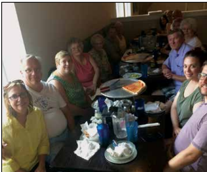
Msgr. Beeda District members enjoy a night out at Vesuvio's Restaurant.