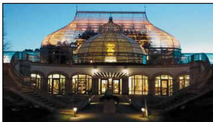
Phipps Conservatory and Botanical Gardens in Pittsburgh.