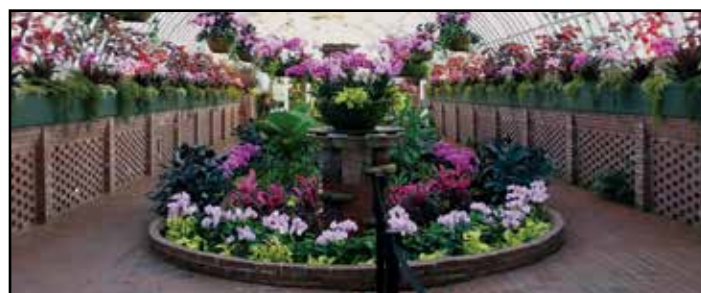
A greenhouse full of lovely blooms.