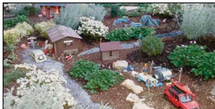
One of the displays in the conservatory.