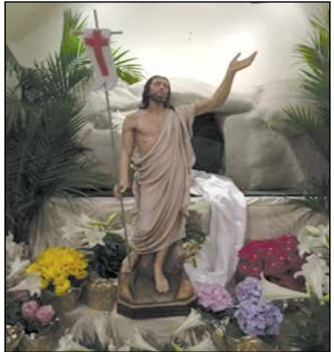
Christ is risen! Truly indeed He is risen, Alleluia!

God of glory, the eyes of all turn to you as we celebrate Christ's victory over sin and death. Bless us and this food of our first Easter meal. May we who gather at the Lord's Table continue to celebrate the joy of his resurrection and be admitted finally to his heavenly banquet. Grant this through Christ our Lord. Amen.