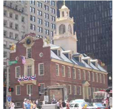
Old State House Boston, Massachusetts

Today, the event is commemorated every year with a Fourth of July reading of the Declaration from the Old State House balcony - but no bonfire.