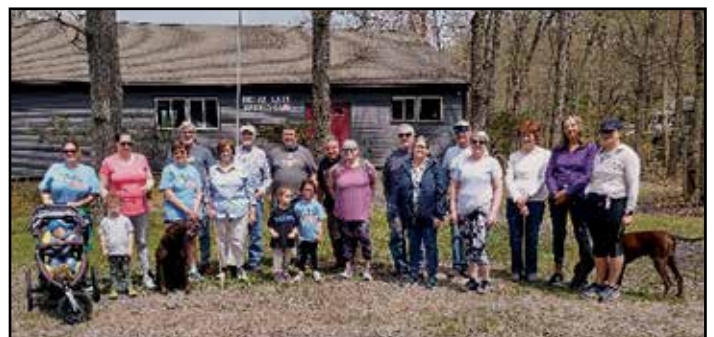
Some of the members of the Landwalkers Team.