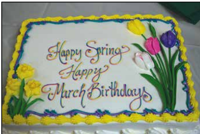
A delicious cake was served at the meeting.