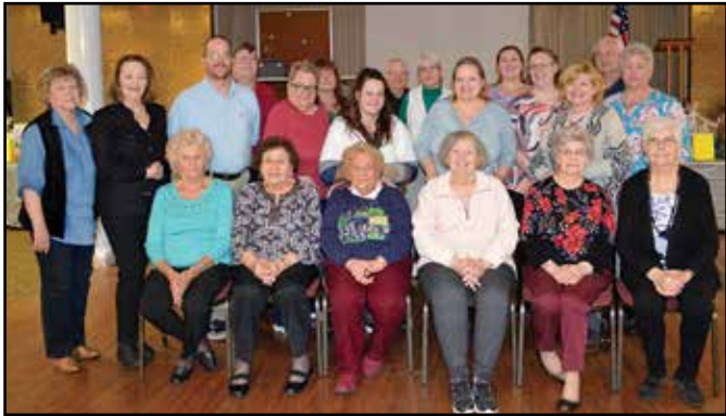
Members who attended the Pittsburgh District's spring meeting.

A Chinese auction was also held and everyone went home with a door prize.