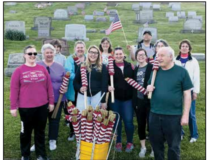
Pictured are members of Branch 64 who helped to place flags in Christ Our Redeemer Cemetery in observance of Memorial Day.

As a bit of history, Memorial Day was first observed on May 30, 1868, when flowers were placed on the graves of Union and Confederate soldiers at Arlington National Cemetery. The values those men fought to defend form the essence of our country: freedom and the rights of the individual. Memorial Day is a solemn occasion honoring the American men and women who gave their lives in while serving in the military.