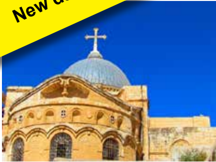
Church of the Holy Sepulcher