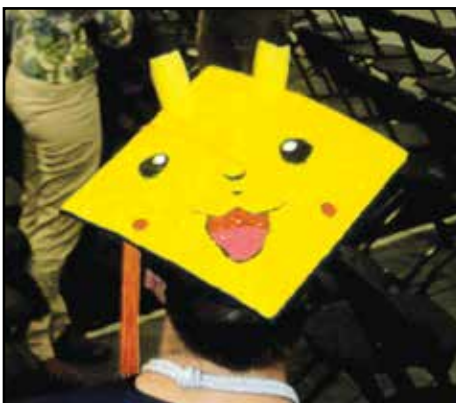
Casimir's Pikachu mortar board.