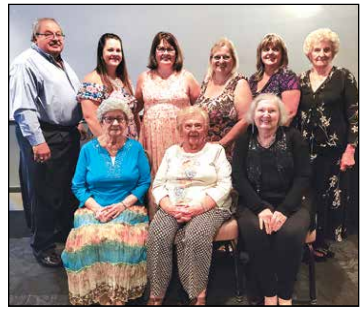
Pictured are some of the LPSCU members who attended the Slovak Radio Hour's annual dinner-dance.