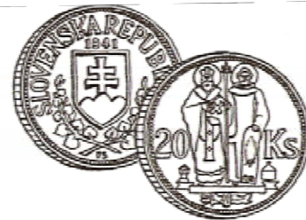
The Slovak Republic (1939-45) honored SS. Cyril and Methodius with a special silver coin.

The saints' feast day is celebrated by the Roman Catholic Church on February 14 as Saints Cyril and Methodius Day. In the Czech Republic and Slovakia, the two brothers were originally commemorated on March 9, but Pope Pius IX changed this date to July 5. Today, Sts. Cyril and Methodius Day is celebrated on the date believed to be the arrival of the two brothers to Great Moravia in 863 and is a national holiday both in the Czech Republic and Slovakia.