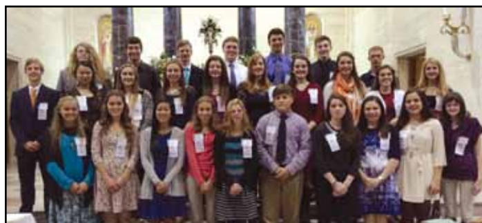
Student recipients of the 2015 Servant Leadership Award.

The ceremony ended with a reception at Maria Hall.