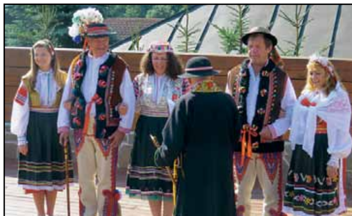
A mock traditional Slovak wedding ceremony, complete with reception, was a highlight of the 2015 Slovak Consular Tour.

If you are interested in a copy of the itinerary when it is completed, contact Joe at jtsenko@aol.com or 412-956-6000.