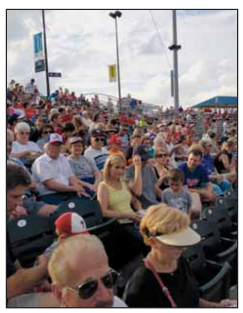
A group of Lehigh Valley Okres members at the Lehigh Valley Iron Pigs vs. Columbus Clippers baseball game.