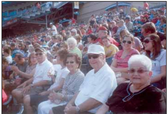
Some of the Lehigh Valley Okres members who attended the Iron Pigs-Columbus Clippers game.