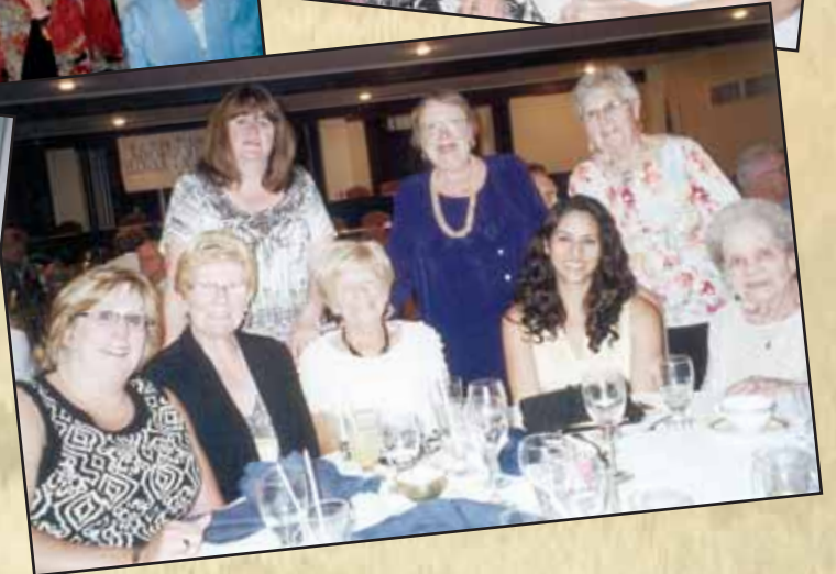
Convention Banquet photos were taken by Cecilia Gaughan.