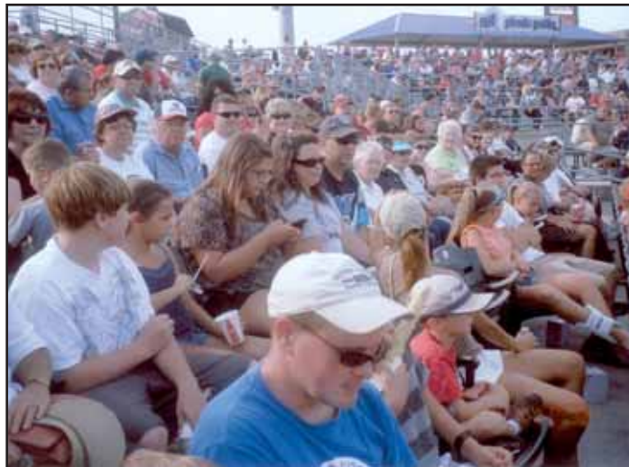
A group of members who attended the Iron Pigs game courtesy of the Lehigh Valley Okres.