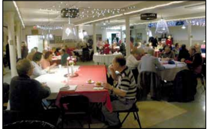
Those attending the Mass on the Feast of Saints Cyril and Methodius enjoy a meal and fellowship in the social hall of Saints Cyril and Methodius Church hosted by the Youngstown Chapter of the Slovak Catholic Federation.

The Mass, which began at 5:30 p.m., was attended by individuals from a broad cross-section of parishes throughout the diocese. Thanks in part to notably mild weather for the month of February, the turnout was the largest in recent years. A dedicated group of parishioners from Our Lady of Sorrows prepared the meal that featured traditional Slovak fare. They also devoted significant time and energy to decorate the church and