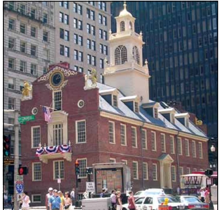
Old State House Boston, Massachusetts