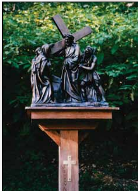
The post and platform of Station 4

In Part IV, our conclusion, to follow, we will explain the mounting of all the Stations, along with the ensuing, inordinate, and final delays that occurred. Additionally, we will relate the climatic completion of the project and the immediate outpouring of spiritual graces that flowed in abundance to family members and others.