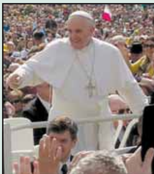
His Holiness, Pope Francis at the General Audience, Wednesday, April 17, 2013.