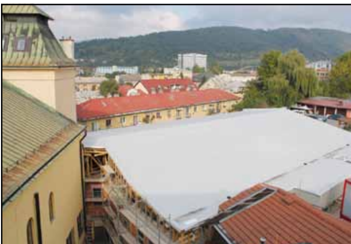
The exterior of the new gymnasium takes shape.