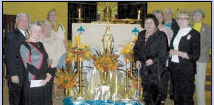
LPSCU Branch 42 members who attended the special service.