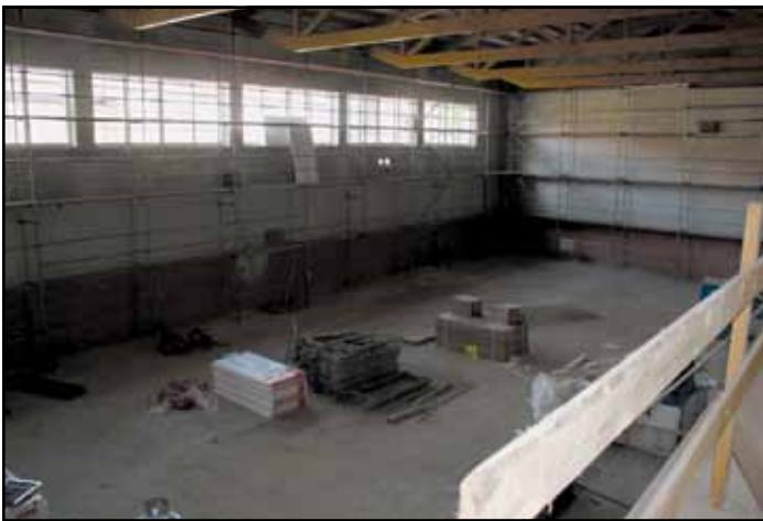
Progress continues on the interior rooms.

Pictured is the progress of the construction as of September 2014. For more information and to follow the building's progress, log onto the gymnasium's website at www.gsf.sk .