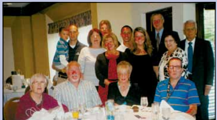
Lehigh Valley area members enjoy the Breakfast Buffet.