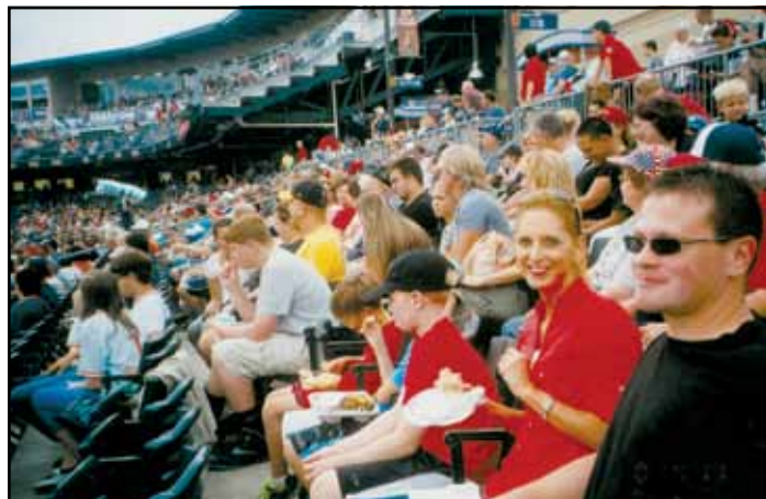
Members and guests of the Lehigh Valley Okres enjoy a night at the ballpark in Allentown.