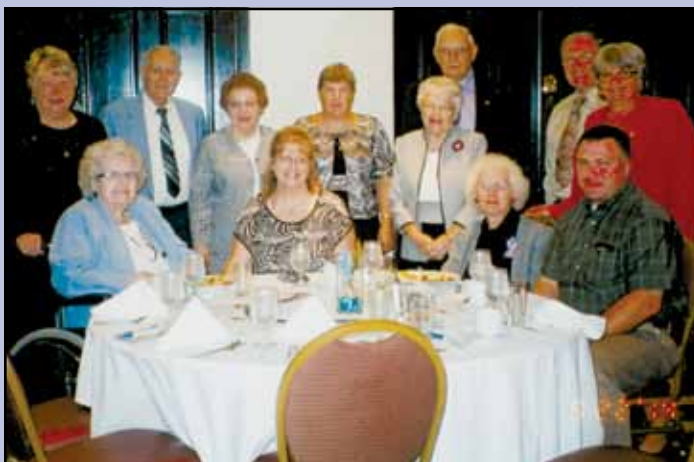
Members from the Lehigh Valley at the Board Meeting Breakfast Buffet.