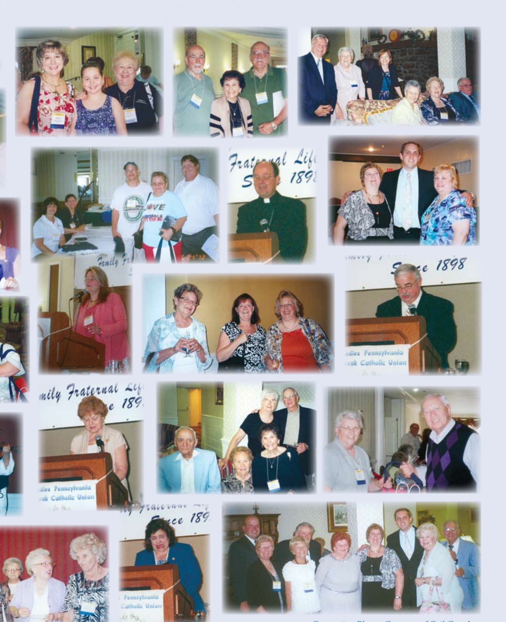
Convention Photos Courtesy of Ceil Gaughan.