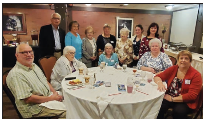
Some members take a break from breakfast to pose for a photo.