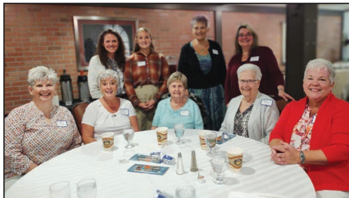
A group of attendees at the “Breakfast with the Board.”

In addition to enjoying a delicious breakfast, everyone in attendance received a pocket hand sanitizer and a beautifully embroidered blanket. The consensus of the group is that it was a morning well spent!