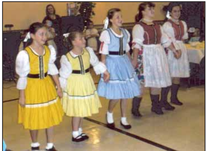
Young members of the Pittsburgh Slovaks perform.