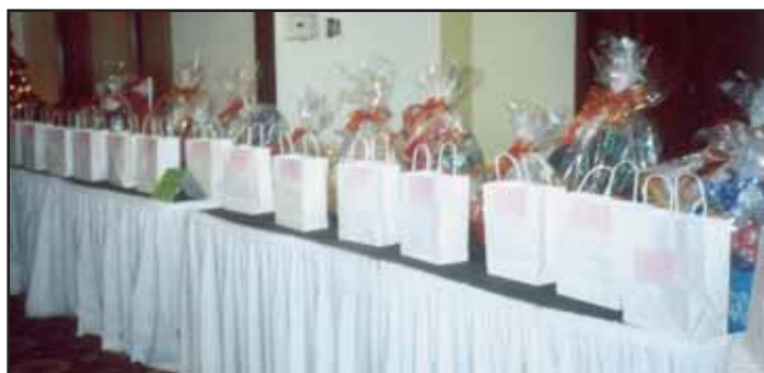
Some of the many gift baskets that were raffled off to benefit Allentown's Diocesan Soup Kitchen.

The LPSCU initiated the Matching Fund Program on January 1, 2011.