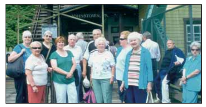
Pittsburgh District members enjoy an outing to Johnstown's Inclined Plane.