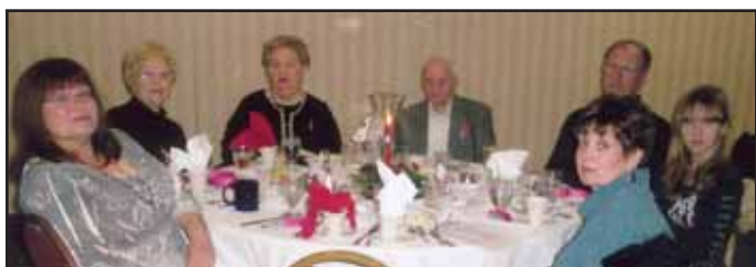
Members and guests enjoying the Pittsburgh District's Christmas party.