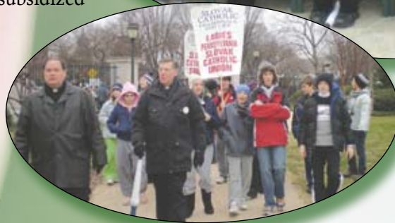
Marchers from the Ladies Pennsylvania Slovak Catholic Union, First Catholic Slovak Ladies Association, and Slovak Catholic Sokol join forces to represent the Slovak Catholic fraternalists at January's March for Life in Washington, D.C.