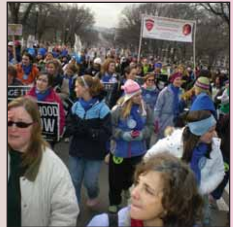
March for Life participants as far as the eye can see walk along Constitution Avenue towards Capitol Hill and the U.S. Supreme Court.

National Mall where the marchers heard speeches that centered on fighting the now-stalled healthcare reform package and ensuring that any future healthcare plans would prohibit the use of federal funding for abortion. The issue of healthcare reform dominated the speeches and prayers were heard