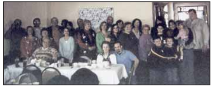
Some of the members and guests of Branch 52 who enjoyed the joint Branch Christmas Party and LPSCU Anniversary celebration.

The observance of the 110th Anniversary of the founding of the LPSCU (which was formed in November 1898 in Hazleton Pennsylvania) and the annual Branch 52 Christmas Party were celebrated on Sunday, December 7, 2008, at the Grandview Golf Club of North Braddock in Western Pennsylvania.