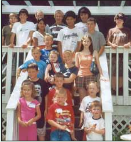
Lehigh Valley Okres children at LPSCU 110th Anniversary Celebration.