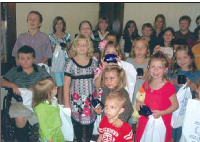
The children in attendance receiving their gifts.