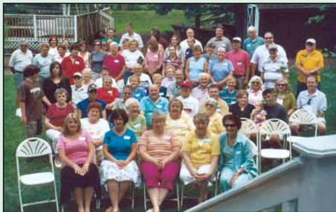
LPSCU members from the Lehigh Valley area and Board members at the Lehigh Valley Okres picnic celebration.