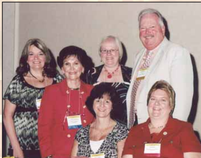
Officers with National Slovak Society representatives.