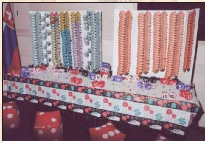
Poster illustrates the "Roll the Dice" campaign results.