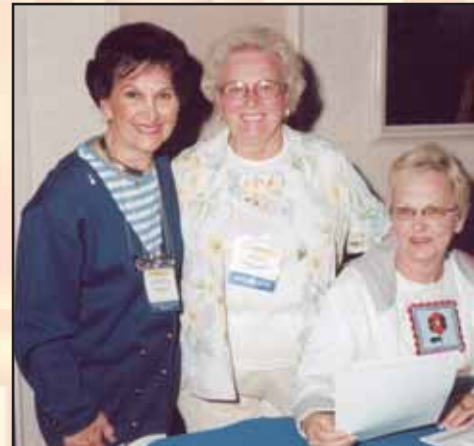
Greetings Committee members.