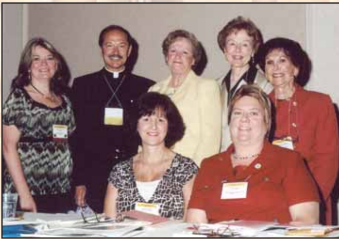
Officers with representatives of the FCSLA who greeted the convention.