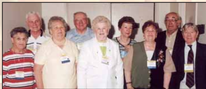
Members of the Salary Committee.