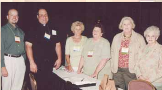
Members of the Donations Committee.