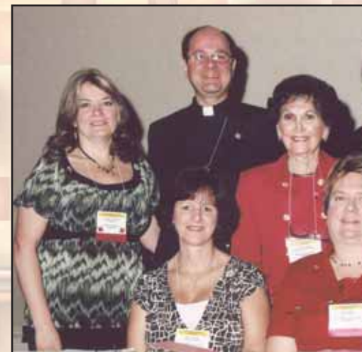
Officers with FCSU representatives.