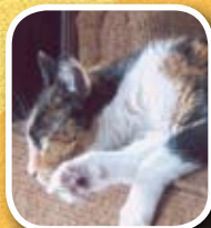
CHLOE & BAILEY