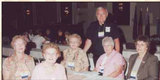
The Resolutions Committee meets.