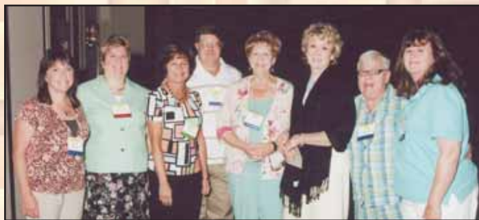
Members of the Balloting Committee.