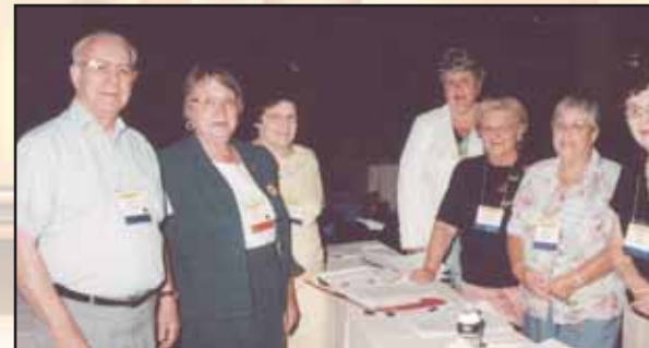
Members of the Nominating Committee.