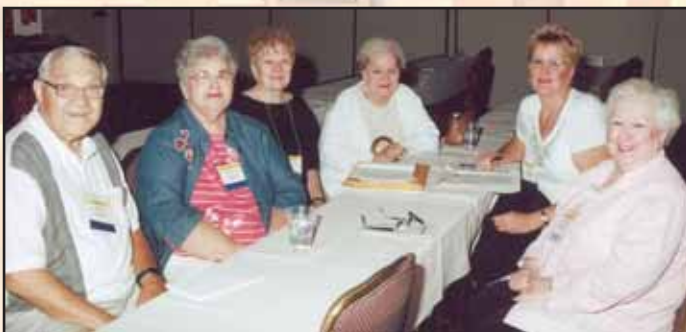
The Recommendations Committee meets.