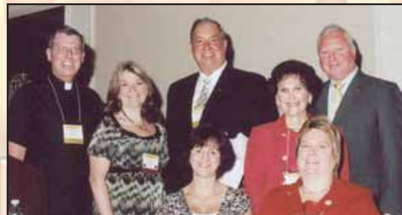
Officers with Slovak Catholic Sokol representatives.