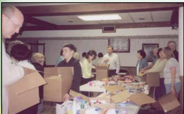
U.S. Congressman Charles Dent (center), who recently visited Iraq, speaks to Lehigh Valley Okres members as they prepare packages to be sent to the troops.

For two weeks leading up to Join Hands Day , Okres members collected snacks, personal care items, magazines, playing cards, videos, music tapes, and other appropriate items for our servicemen and women stationed in Iraq and Afghanistan. Large contribution boxes decorated in red with patriotic ribbons were placed in the churches and with business participants. By Friday, May 2, over 700 lbs. of donations had been collected. Each item was then sorted into separate boxes as appropriate.