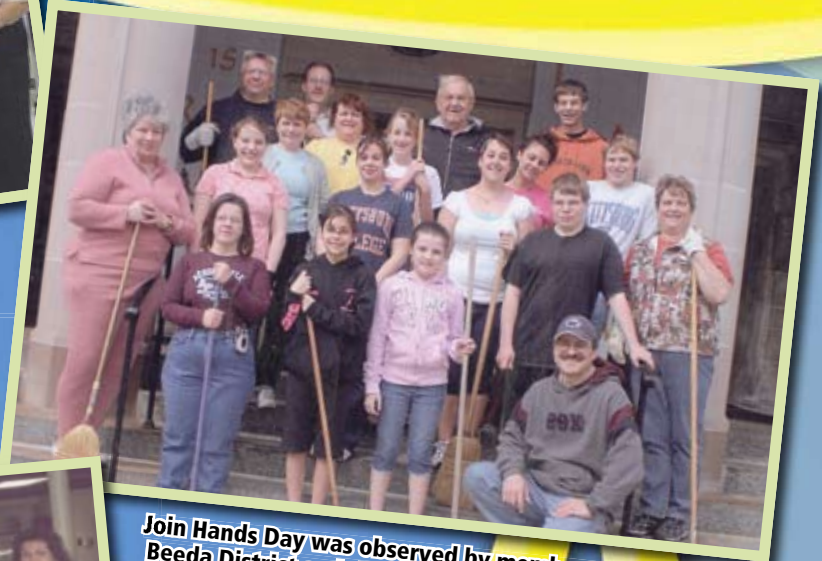
Join Hands Day was observed by members of the Msgr. Beeda District and the St. Joseph Youth Group at St. Joseph Church, Hazleton, Pennsylvania.