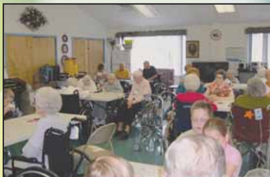
District members and student volunteers playing bingo with the residents of The Laurels Skilled Nursing and Rehabilitation Center.