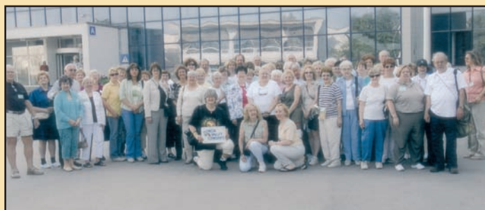
American tourists outside the U.S. Steel offices in Kosice.