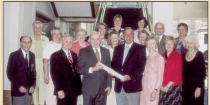
Pictured above are representatives of the National Slovak Society, First Catholic Slovak Union, First Catholic Slovak Ladies Association, Ladies Pennsylvania Slovak Catholic Union, Greek Catholic Union, Slovak Gymnastic Union Sokol, and the Slovak Catholic Sokol who participated in the historic ceremony in which the Pittsburgh Agreement of May 18, 1918, was presented to the Senator John Heinz Regional History Center.